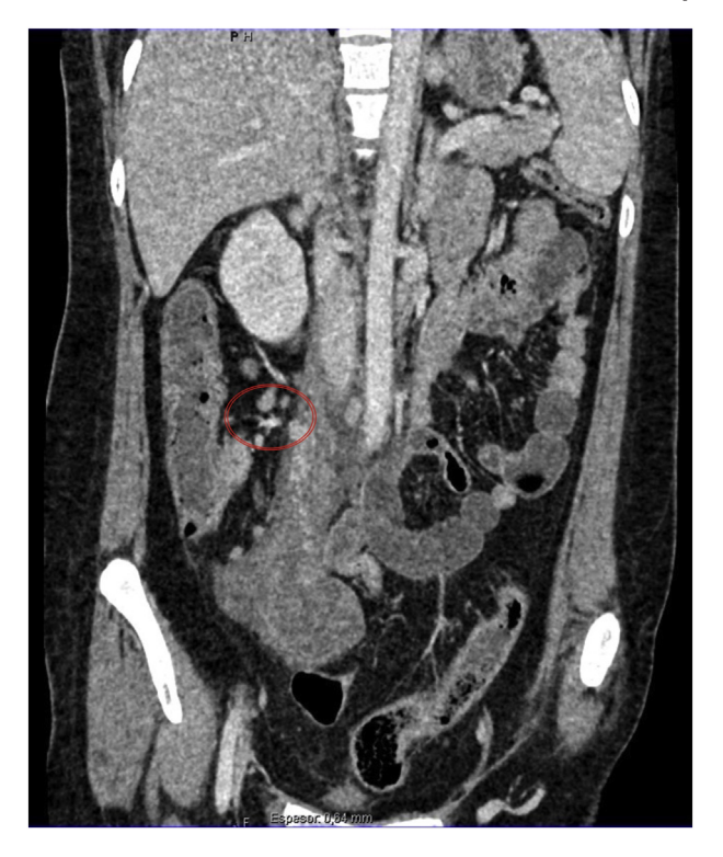
Fig. 1. Abdominal CT scan with IV contrast in coronal plane. Enlarged right adnexa with haemorrhagic changes and no contrast present, suggestive of necrosis. Absence of venous blood flow and engorgement of the venous territory on the right ovarian veins can be seen; suggestive of thrombophlebitis.

necrotic, with no sign of torsion but with evident thrombosis of the infundibulopelvic and ovarian suspensory ligaments (Fig. 2). There were no other pathological findings. A right adnexectomy was performed and the surgical piece was sent for anatomopathological diagnosis.